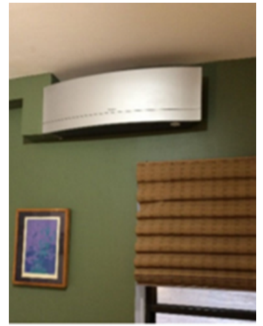
Interior building shades from Northern view

https://www.habitatmag.com/Publication-Content/Green-Ideas/2021/2021-February/Upper-West-Side-Co-op-Steps-Into-the-Electrified-Future