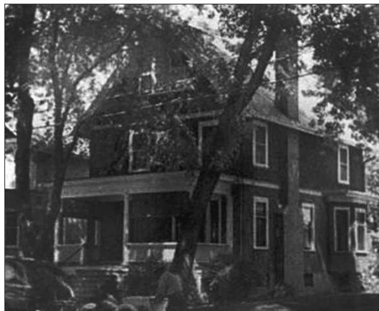
Small office buildings are often old houses, such as this one in Ithaca, N.Y. (circa 1954 at right, present day at left).